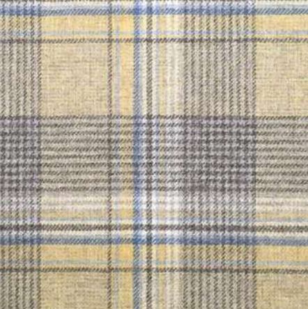
Wagtail - Sandstone

Delicately coloured intricate plaid twill woven in Lancashire in soft Shetland wool.