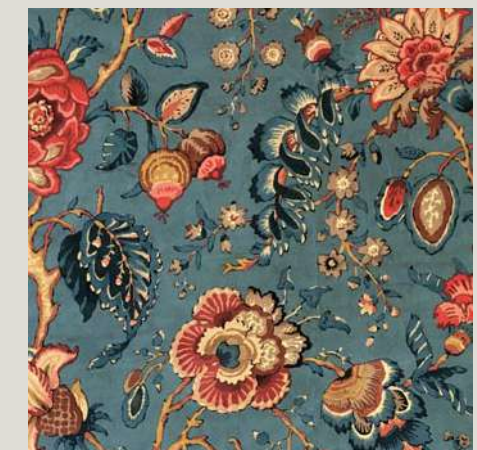
Velvet | Tiger Moth