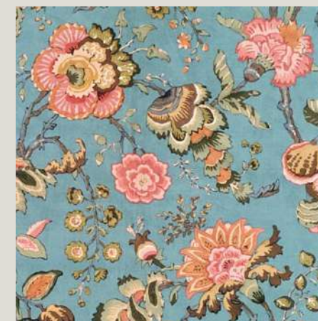
Velvet | Coral Sea