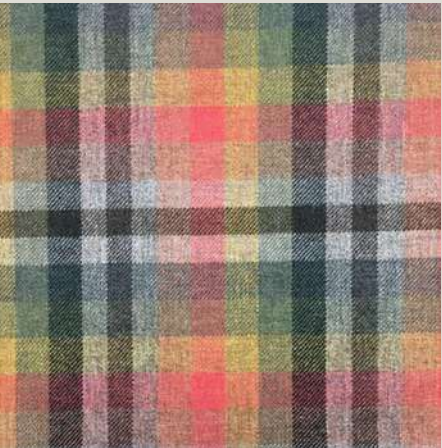
Mandarin Plaid Flame

Wonderfully fine Scottish wool plaid with exuberant colours. Just one amazing colour way