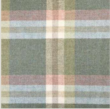
Wigeon - Moorland

A large twill Scottish plaid in beautifully soft and muted colours of lamb’s and Shetland wools.