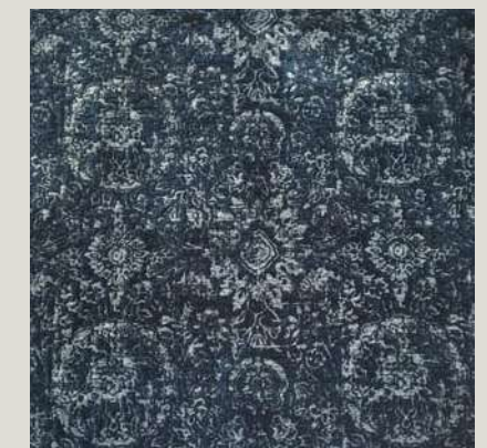
Large scale- to show medallion design